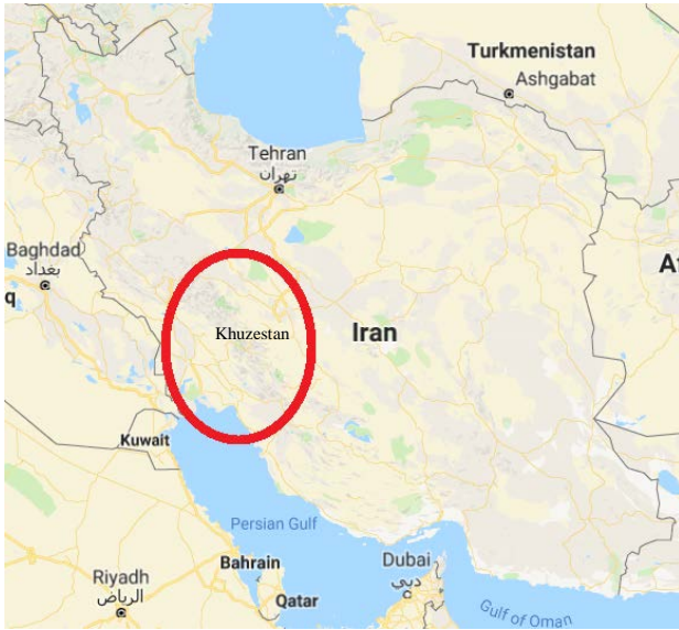
Figure 2. Geographical position of Khuzestan province [10]

Khuzestan plain is one of the most fertile agricultural areas in Iran where agricultural products in this province have potential for biogas production. Wheat, maize and sugar cane are the most crops in this reign which has high potential for producing biogas, one of the most applicable forms of biomass energy. Production of biogas from putrefying materials and livestock wastes can help region economy and the outputs of Biogas power plant may be used as fertilizer in domestic agriculture.